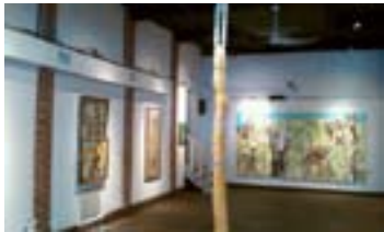
The Distillery Gallery & Art Space